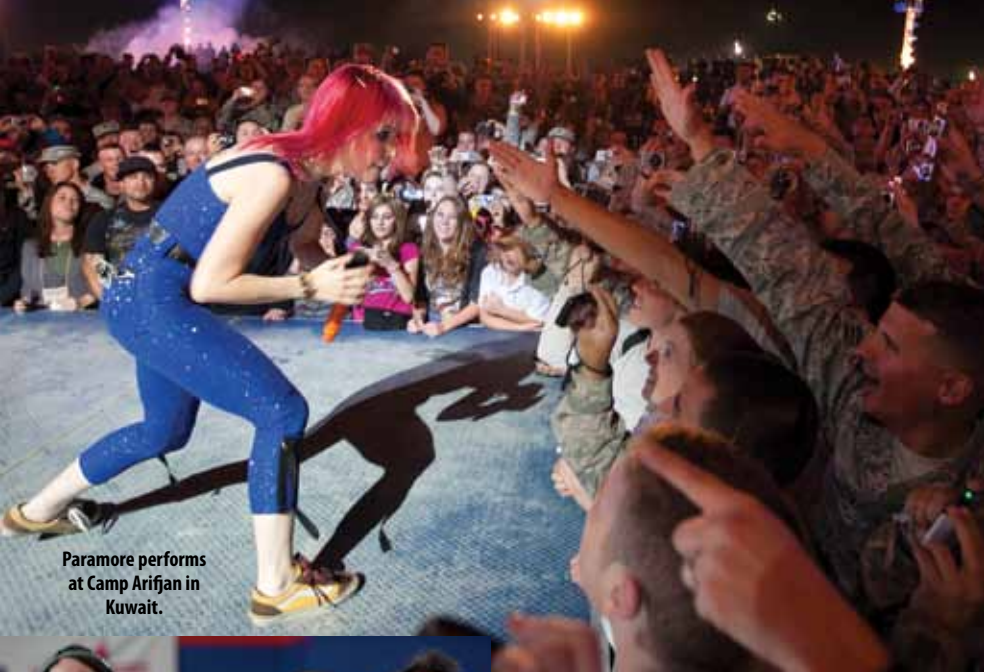
Paramore performs at Camp Arifjan in Kuwait.